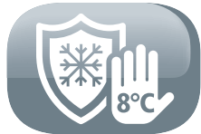
Home freezing prevention