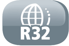
Environmental friendly refrigerant