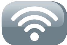
Wireless smart kit