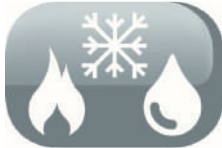
3 functions in 1