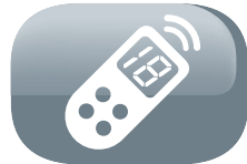
Remote control with LCD-display