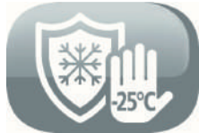
Extra frost protection in outdoor unit