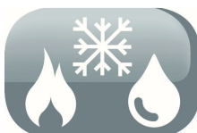
3 functions in 1