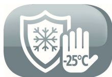
Extra frost protection in outdoor unit